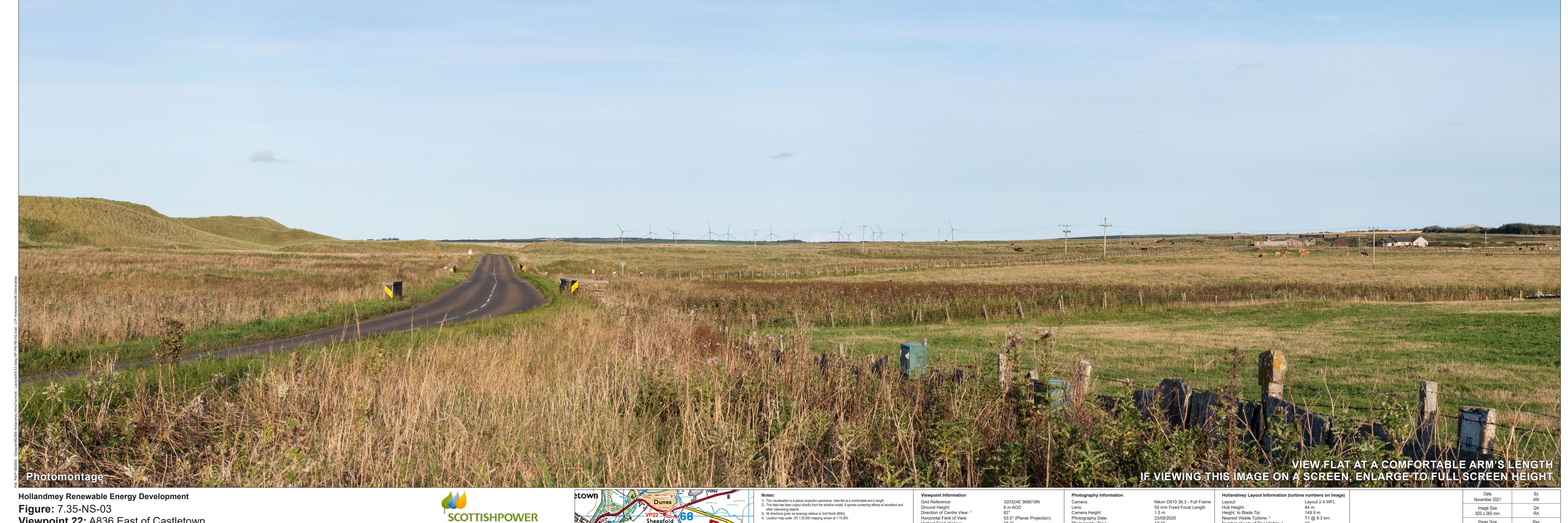
Figure: 7.35-NS-03 Viewpoint 22: A836 East of Castletown